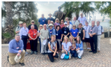
Holy Family Hospital Foundation’s full pilgrimage group, October 2022